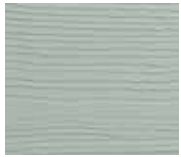
Cape Cod Gray