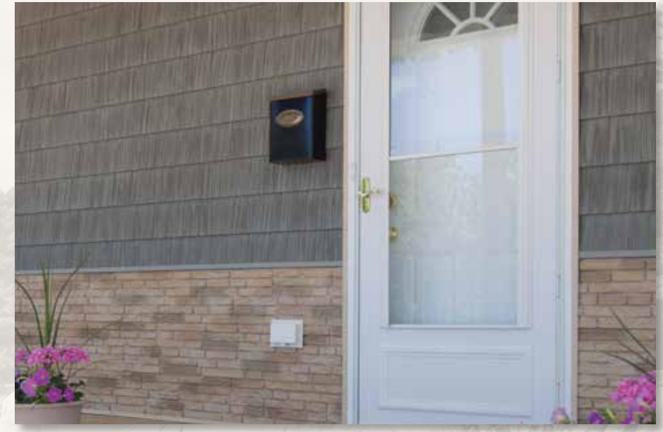
Stacked Stone, Durham County (885), 7" Split Shake, Vintage Green (823); Mid-America Louver Shutters, Black (002)