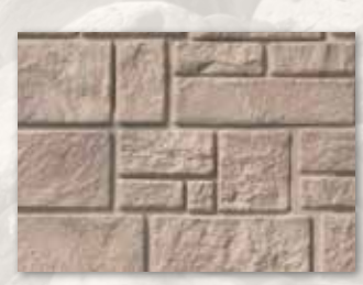
Red Rocks (852)