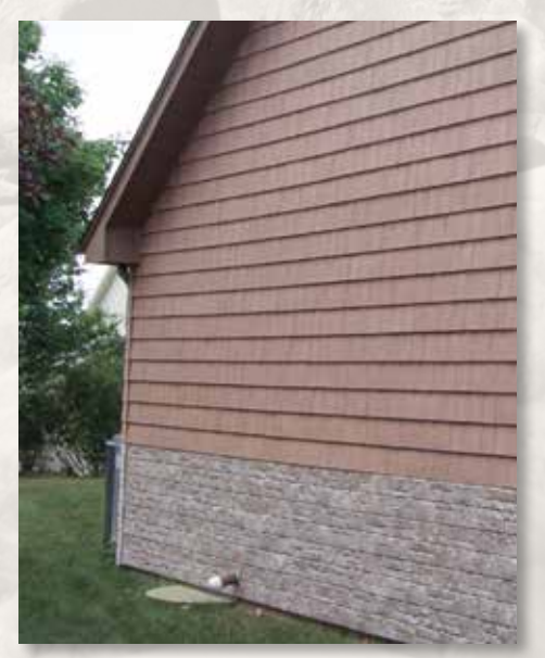
Limestone, Mesa (853); 7" Split Shake, Rustic Brown (828)