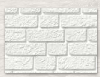
Glacier White (123)