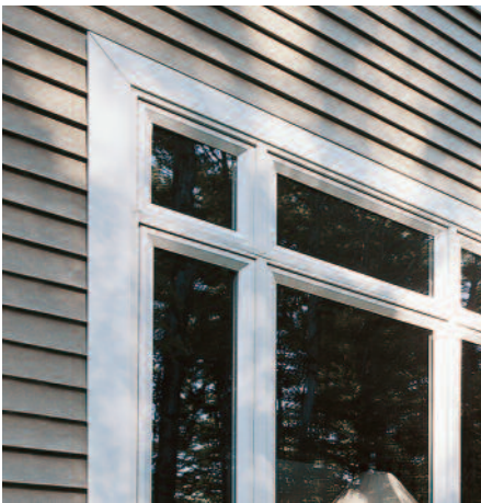
Trimworks® 5" window trim.