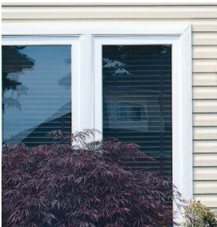
Trimworks® 3 1/2" window trim.