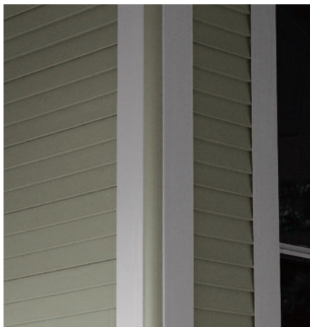
Trimworks® three-piece beaded corner post.