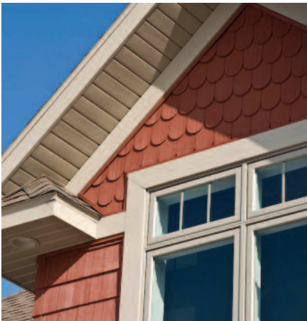
Alside Premium Scallops – Victorian inspired half-round shingles.