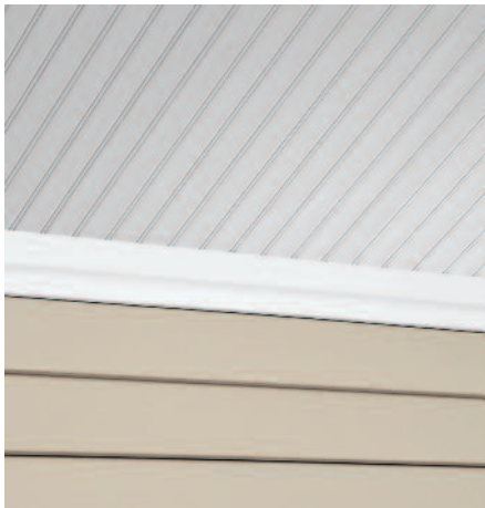
Greenbriar® Vintage Beaded soffit and Trimworks® soffit crown molding.