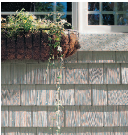
Alside Premium Shakes – the classic look of deep-grained cedar shakes.