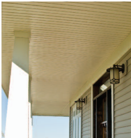
Charter Oak® invisibly-vented soffit.