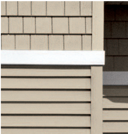
Horizontal band board provides a strong horizontal accent.

ChromaTrue® ChromaTrue helps make Board & Batten better with ASA weatherable polymers which provide superior fade resistance and better performance on darker colors.