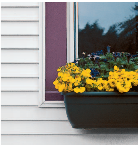
Trimworks® custom crown molding used with wood window trim.