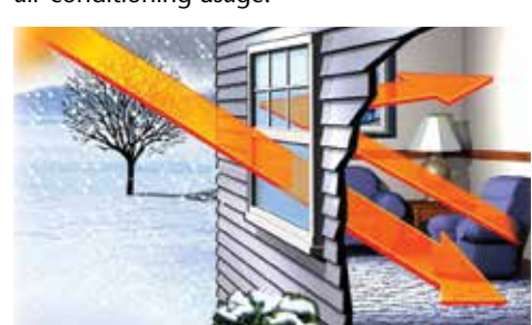
Winter Energy Savings: Low-E insulating glass reduces heat loss by reflecting warm air back into your home.