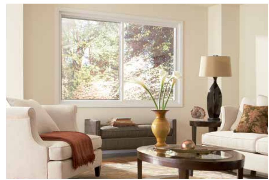
Above Top: Fusion Double-Hung Windows feature a constant force balance system to ensure smooth operation; both sashes tilt in for convenient cleaning from inside your home. Above: Fusion Sliding Windows glide horizontally on a nylon-encased dual brass roller system, and the sashes lift out for easy cleaning.