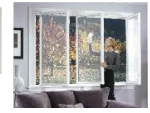
Caring for your new Swing & Clean Windows is a snap with the easy-to-use swing-in sash design. The windows unlock quickly and effortlessly for easy access.