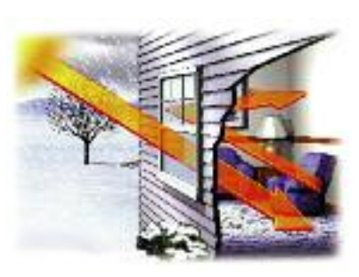
Low-E glass takes on a new duty in winter months. It lets warm solar rays into your home, while preventing indoor heat from escaping.