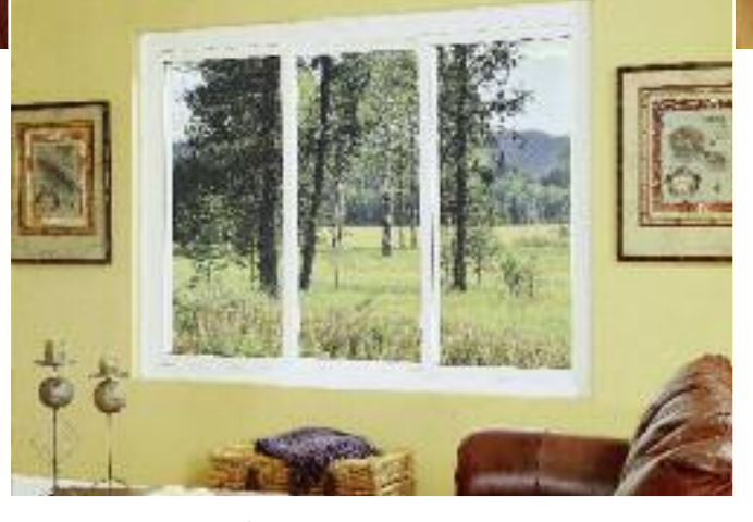
Discover how a Swing & Clean Window can enhance the beauty of your kitchen or living room, by providing a brighter, panoramic view of the world. And thanks to the simple-to-use swing-in design, cleaning is a snap.

Alside Swing & Clean Windows are a perfect demonstration of our pursuit of performance, intelligence and beauty. Our windows offer a crisp, clean design that will accentuate both the interior and exterior style of your home.