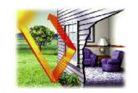
Low-E glass filters long-wave radiation from the sun. This reduces solar heat gain from the summer sun, helping to keep your home cooler.

Another critical NFRC test is for Solar Heat Gain Coefficient (SHGC). This procedure measures how well a product blocks heat caused by sunlight. Again, the lower the number, the less solar heat the window transmits into the home. The above chart clearly shows how the performance of Swing & Clean Windows can be enhanced with the addition of various ClimaTech insulated glass packages.