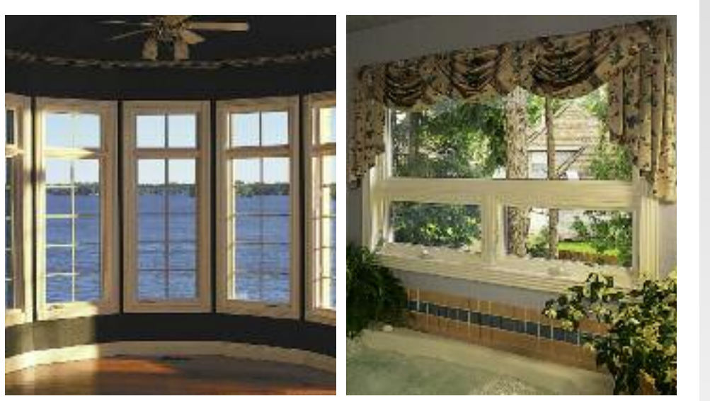
A beautiful complement to any room, casement windows feature an easy-touch crank to open and close the window. Sash opens to a 90° angle for convenient cleaning from inside the home.

Casement and awning windows round out the new construction window offering from Alside. Combine casement or awning windows with a variety of window styles and configurations to create larger window systems that offer ample glass exposure and ventilation.